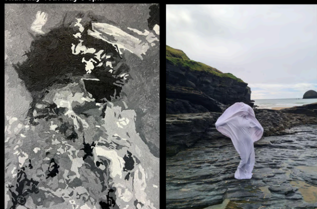
GCSE Art & Photography Exhibition Thursday 16th May 6-8pm